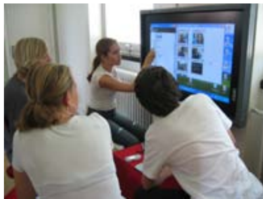
Figure 1: Pupils working with the eBag on a large display in the school library.

In advance, the teacher has prepared some concrete assignments and inspirational material to get the groups started on the project. The teacher opens his eBag on the interactive display and finds the assignments. After having gone over the links and assignments in plenum, the teacher puts the material in the pupils' eBags by dragging it onto the icons representing the groups. The material is automatically placed in the shared project folder of each of the eBags. The material is assigned to the specific project folder by evaluating a range of variable properties e.g. time of day, teacher/pupil relationship, physical location, and class