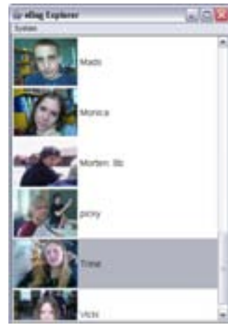
Figure 7: The eBagExplorer with a list of eBag icons.

These applications can be running on various technical platforms, affording different kinds of interaction with the eBag application. The platforms and display types that we