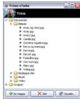
Figure 8: Trine s eBag opened.

have currently used range from tabletPC, laptop, and desktop computers with screen display, SmartBoard display, and floor projection.