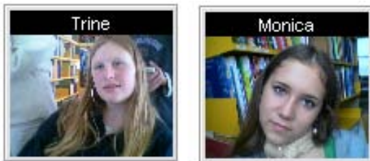
Figure 6: The eBag icons for Trine and Monica s eBag.

The eBag Daemon application shows the eBag icons of registered BlueTooth devices nearby a preselected BlueTooth sensor. An example of how eBag icons are presented is depicted for the eBags of two pupils Trine and Monica in figure 6. The eBag icon has the profile name at the top, the associated profile picture in the middle and can have a message if supplied at the bottom.